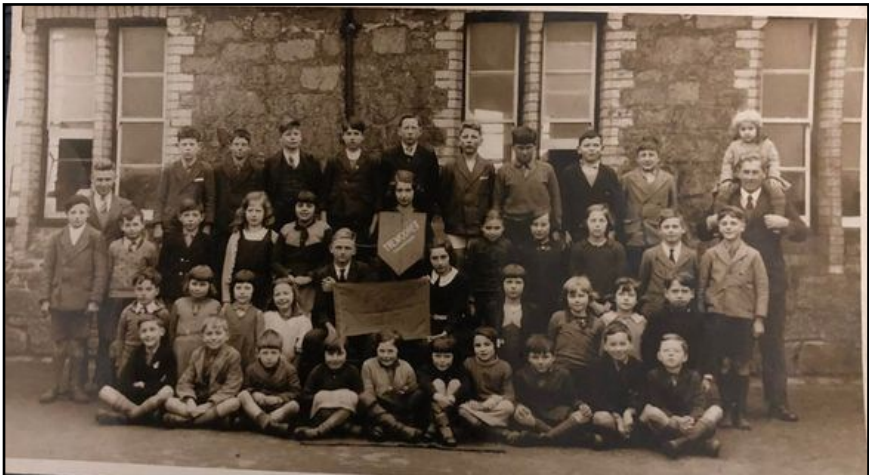
Tremodrett School c1918