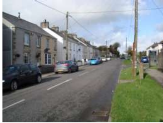
Figure 3.15 - Terraces of workers cottages close to Trezaise Square

As this was a passenger station, this was also a natural area of the Village for large houses for those who might commute or have business interests elsewhere; these could easily be placed in the large plots already existing. The earliest of these 'suburban' cottage-villas are perhaps those in Tremodrett Road – larger than cottages, smaller than the fully-fledged villas seen along Fore Street or Harmony Road. Chapel Road has the best surviving sequence, especially of the early 20th century, others are in Victoria Road, which remains as a relatively pleasant heavily planted approach dropping down into the Village centre. As the station was also a major transfer point for china clay brought by road from the clay works to the south and west of Roche, this was also a convenient part of the Village for terraces of workers' housing; these are seen most obviously near the central junction, close to the shops (and close to what must already have been around 1900 an undesirably busy road for the better-off to live near), in Harmony Road and Edgcumbe Road, and at the east end of Chapel Road and Tremodrett Road.