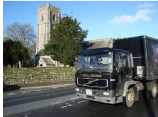
Figure 3.2 - The dangerous junction at Churchtown

which creates a barrier between the various parts of the Churchtown.