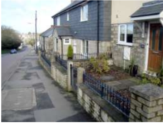
Figure 2.13 - Where space permits, the boundary between public and private space should be clear and site lines along existing streets maintained

The type of boundary should fit in with the character of the location and local traditions. Hedges and hedge-banks are typical in rural locations and edges, and the more dispersed settlement areas.