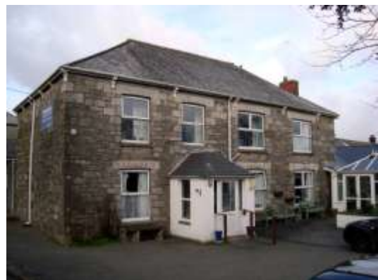
Figure 3.8 - No. 1 Tremodrett Road in the 'lower town', now a care home for the elderly

Something of this genteel, park-like character extends the churchtown/rectory area into other, later, parts of the Village (see below – 'the lower town'.