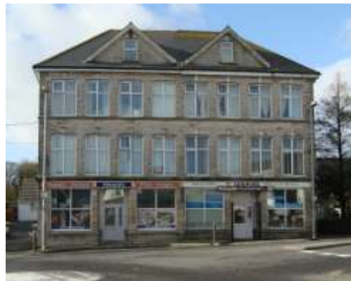
Figure 3.16 - 13-17 Edgcumbe Road

By the turn of the 20th century, there was the tight concentration of buildings seen around the central junction. This is a varied, sometimes bizarre, almost unclassifiable group; long, rendered buildings gable end to the road jostle with the tall, four-square stone and brick commercial bravura of 13-17 Edgcumbe Road, and with the long rendered terraces of cottages.