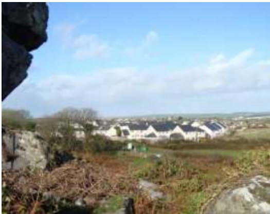
Figure 2.1 - Recent developments have encroached on Roche Rock with little regard for its historic setting

Development must make a positive contribution towards the distinctive character and form of the Parish as a whole and Roche village in particular, especially the older parts of the Village, and relate well to its site and its surroundings, especially views from and to Roche Rock and the Church.