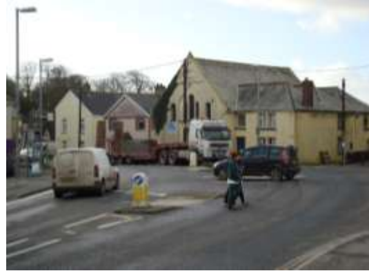
Figure 3.14 - Roche Temperance Hall built in the 1880's. Development in this area seems to have been stimulated by the creation of the railway station at Victoria

This area has seen the most change from its pre-industrial origins. There is little here of the 18th/19th century farming hamlet that once stood roughly where the Temperance Hall is now.