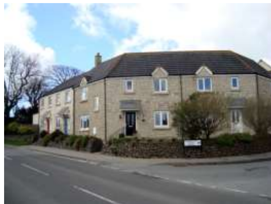
Figure 2.4 - Some recent developments in the Village have been designed to fit well with their setting

The layout of buildings and access needs to reflect local patterns in order to 'fit in' effectively and to be responsive to the characteristics of the site and its setting.