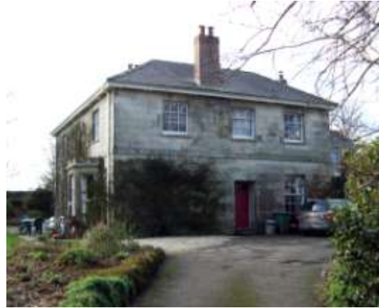
Figure 3.7 - The Old Rectory, set in mature gardens is one of Roche's finest surviving buildings

bly designed both to shield the rectory from the road and to visually emphasise the central importance of the Church.