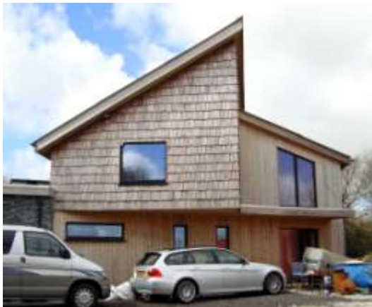
Figure 2.3 - In this contemporary design, traditional materials have been cleverly referenced but have been re-interpreted for a modern, stylish look

The quality of design must, therefore, ensure that new buildings contribute positively to the historic character and form of the community. When a traditional design is followed it must be correctly proportioned and detailed and seek when possible to use historically-correct materials. Any development proposal that may affect a listed building or its setting must be discussed with heritage officers at Cornwall Council and with the Parish Council at an early stage of the planning and design process. Layout design should follow historic patterns of development rather than modern 'estate' layouts.