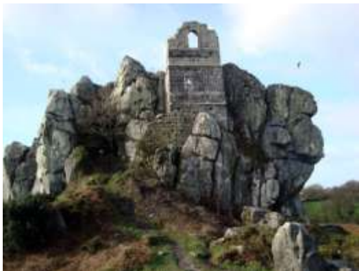
Figure 3.4 - Roche Rock was at the centre of one of Cornwall's oldest pilgrimage networks. Its spectacular setting is in danger of being eroded by the encroachment of modern development

Roche was the centre of a pilgrimage network (see History Appendix); the link between the Parish Church and the chapel on the Rock is an important part of the character of the Churchtown (the Parish Church is dedicated to St Gomonda of the Rock), and in return, of the setting of the Rock, perhaps the most famous monument in central Cornwall.