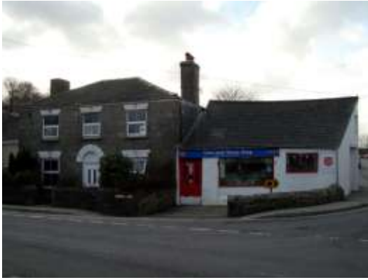
Figure 3.11 - There are a number of small shops of historical interest in Fore Street