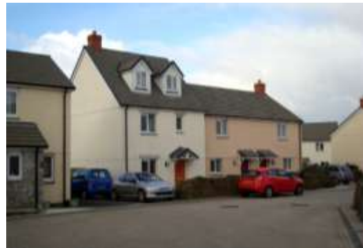
Figure 2.15 - It is recognised that on street parking reduces traffic speed. Where this is not possible discreet parking should be provided between houses though ideally well back from the street

should generally use shared public on-street parking (see Manual for Streets, 2007).