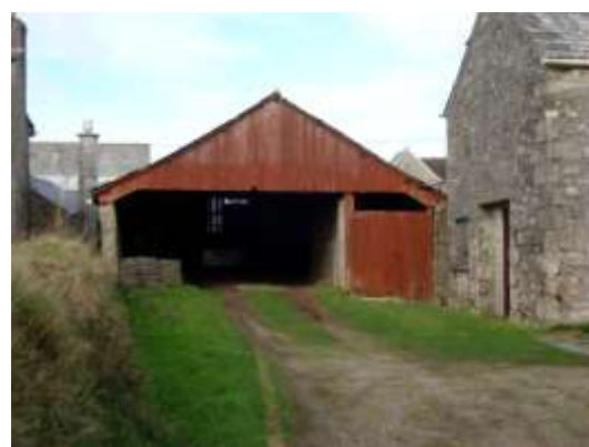
Figure 3.22 - There are a number of interesting outbuildings in Tremodrett and Chapel Road which add interest and colour to the streetscape

The buildings are varied, but all of quality, whether well-built four-square stone houses, arts and crafts/'neo-geo' influenced early 20th century villas and bungalows, or early 20th century public housing, still showing traditional scale, detailing and materials. For the most part they sit well back in generous plots, with mature gardens or substantial grassy areas – but all fronting directly the street and relating to the underlying grid. Interestingly, and perhaps appropriately, the only non-residential buildings that are off-set to this pattern are the exceptionally good, listed, chapel/school/graveyard group (apart from one or two good outbuildings, occasionally strikingly punctuating the street-scene with bright corrugated iron cladding.