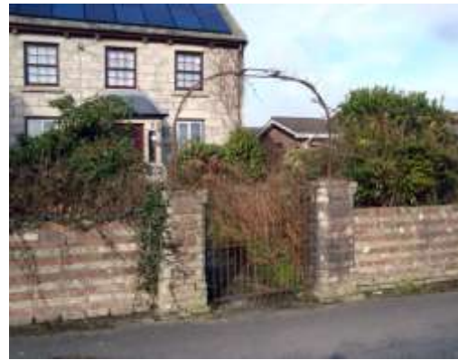
Fig 3.21 - As with Tremodrett Road, properties on Chapel Road are extremely varied in design but almost always of a very high quality

The pattern of large, regular plots (largely undivided) still defines the streetscape; boundaries are still largely made up of hedge-rows, many with shrubs and mature trees. Tremodrett Road in particular retains old hedges and trees that once bordered the stream and leats that ran through the shallow valley here. Where these have been replaced they have been replaced with well-built walls, mostly in stone, but some of brick and terracotta of great interest in their own right. The streets benefit from not being major through routes.