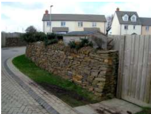
Figure 2.14 - Some recent developments in Roche have made laudable attempts to complement traditional stone wall hedging techniques. Great care should be taken to choose stone that fits in with the local area

The type of boundary should fit in with the character of the location and local traditions. Hedges and hedge-banks are typical in rural locations and edges, and the more dispersed settlement areas.