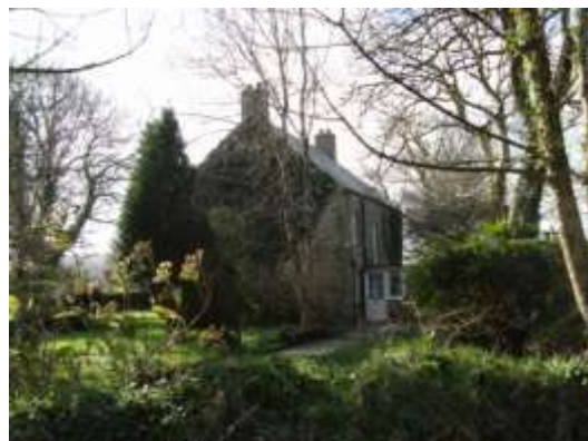
Figure 3.5 - Several beautiful historic buildings and gardens are hidden away at Higher Trerank, immediately adjacent to St. Gomonda of the Rock Parish Church

Immediately away from this unnecessarily, but remediable, damaged streetscape is a timeless, ancient world of old lanes, high Cornish hedges, huge, impressive, mature trees and historic structures. The Church, exposed on the roadside, becomes part of a veiled, protected space, inward-looking and enclosed. Adjacent are the old house plots and townplace of Higher Trerank – one of the oldest sites in the Village, still with two fine 19th century houses, a number of part-ruinous outbuildings, which may be themselves even older, and mature, decorous gardens, into which even a modern bungalow comfortably sits.