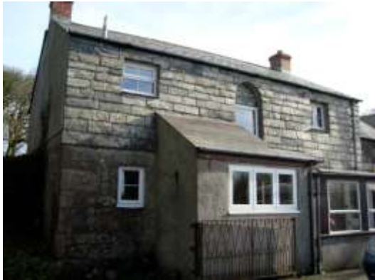
Figure 3.27 - There are several 19th century farm-houses which survive in and around Roche village

farm-houses in and around the Village. These are remarkably consistent in size and form; they are taller, more symmetrical than the Fore Street cottages; although one or two have projecting stacks, most have only simple brick chimneys. All have (or had) rectangular (rather than the earlier square) shaped sash windows, some have round-arched stair windows to rear.