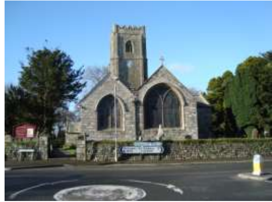
Figure 3.23 - St. Gomonda's Parish Church

The Church of St Gomonda and stands sentinel amid the dense trees of the churchyard, its strikingly tall tower visible over a wide area, a partner to the 15th century chapel atop Roche Rock; the remote ruin of the Chapel of St Michael (an inevitable designation on such a precipitous outcrop) on the Rock, is a two storey structure (chapel over priests room) with a third plinth stage, licensed in 1409. As Pevsner (1970) says 'the carrying up of the granite blocks remains a feat to be wondered at'. The chapel and the rock, and the tower of St Gomonda Church are ancient landmarks still dominating the local landscape.