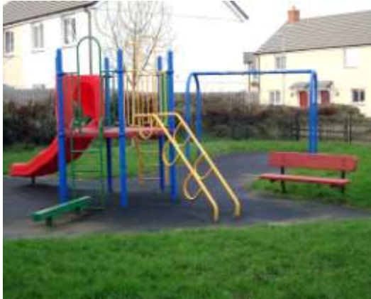
Figure 2.5 - Wherever possible children's play areas should be incorporated into new developments. It is important that play areas are clearly separated from vehicular and pedestrian traffic whilst remaining visible so that children can play safely

Traditional communities like Roche have grown up historically with clear, understandable routes and connectivity. Cul-de-sacs and tortuous routes should be avoided in preference to direct links and connections. There should be clear links between new development and the existing settlement. 20mph will generally be the maximum design speed that is considered appropriate for new streets within residential developments.