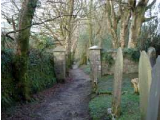
Figure 3.6 - The Avenue behind the Church was laid out in the 1820's to connect the Church to the new Rectory (now the Old Rectory)

The rural character, the dominance of trees above all, continues down the Avenue, laid out in the 1820s to connect the Church with the new Rectory.