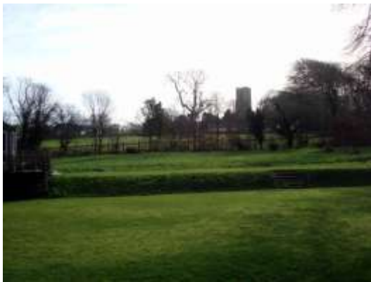
Figure 3.37 - The Glebe Field as seen from the grounds of the Old Rectory

of the Churchtown and most particularly of Roche Rock. The small area of green in front of the post-war housing in Edgcumbe Road and Harmony Road do little to add to the quality of the streetscape. Nonetheless, much of Roche appears to be green and open due to the generous garden plots, enhanced by the well-planted grounds of larger houses - the Old Rectory grounds and Glebe Field in particular are an extremely important green element – visually they act almost like a village green, but they remain inaccessible.