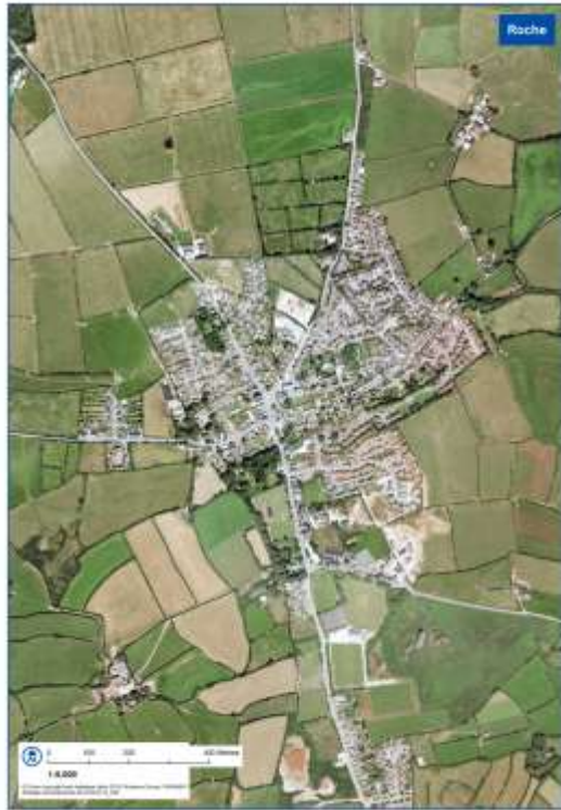
Fig. 3.35 - Although some of the older field systems around Roche have been destroyed by modern housing development, others still survive

The immediate context of Roche, is, as it always has been, agricultural land, an anciently enclosed landscape with remnant mediaeval field systems still discernible. Field systems have been identified on every side of the Churchtown.