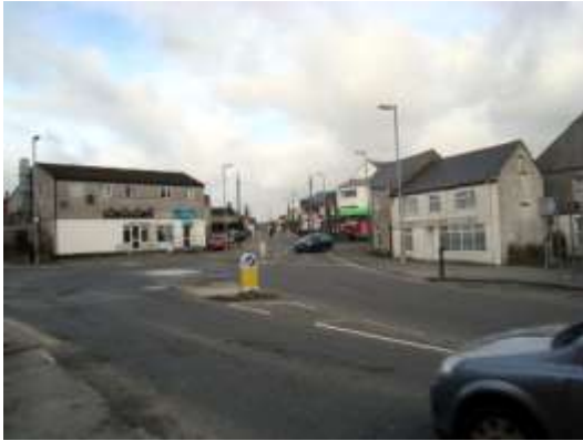
Figure 3.39 - The central junction with a view towards Victoria

But perhaps most characteristic of Roche are the glimpses, the side views into the back yards and outbuildings of the centre, into secret gardens, the unfolding views along short lengths of road like Tremodrett Road, the glorious informal walk along the Avenue into the twisting lanes of the Churchtown. Everywhere these views and glimpses are framed and overshadowed by the dominant canopy of trees.