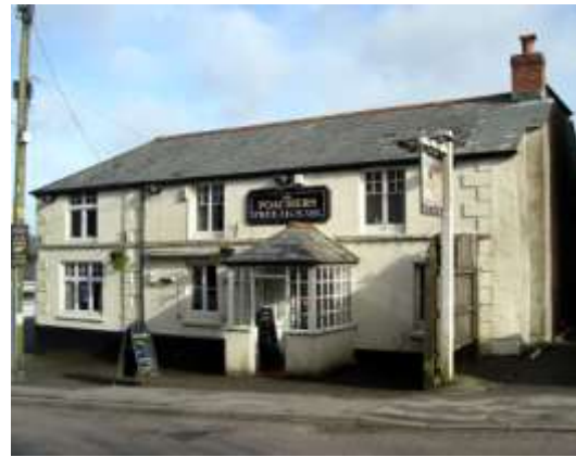
Figure 3.10 - The Poachers Free House. Fore street has a real mix of commercial and residential buildings

Evidence of earlier buildings and streetscapes may have been lost with the demolition or very severe alteration of cottage rows on the west side of the street (although there was always limited development here due to the presence of the glebe). Despite the one-sided effect this gives to the streetscape, the sloping length of Fore Street retains a sense of a true village street, with a real mix of commercial and residential buildings.