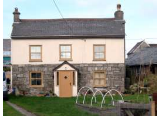
Figure 2.8 - The predominance of pitched roofs and the ratio of solid wall to (window) in historic properties should be used to inform new build

dominance of pitched roofs and vertical emphasis to windows should be used to inform the way in which elevations are handled within new development. The above is not intended to invoke stylistic preferences, merely to ensure that the design of new buildings is consistent with the quality of form and character in the best of Roche Parish.