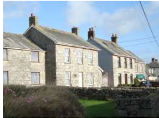
Figure 3.28 - Former smallholding and attached barn in Tremodrett Road

Quite distinctly different are the later 19th century four-square stone houses in Tremodrett Road, these are very finely constructed of dressed stone, with machine-sawn granite lintels, (even though one at least was clearly a smallholding, with its attached barn/challhouse).