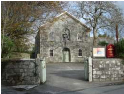
Figure 3.25 - The striking Methodist Chapel in Chapel Road was built in 1835. Its interior was remodelled by Silvanus Trevail in 1877

The quality of the Church is matched by that of the Methodist Chapel in Chapel Road (the Church was gutted in 1822 to provide a rival preaching space to the multiplying Methodist chapels in the area). Built in 1835, it is an elegant dressed granite box with a pediment/gable of two storeys with round-arched windows to the roadside; the interior is the work of Silvanus Trevail who altered it in 1877 when he extended the adjoining schoolroom.