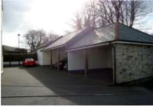
Figure 2.16 - A good example of modern, purpose built garages built using traditional materials