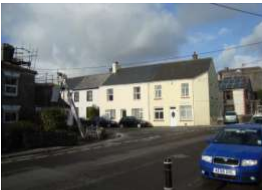
Figure 3.13 - The junction of Harmony Road with Fore Street in 'lower town'

The phrase 'lower town' has little basis in local usage, but is used here as a convenient description of the area centred on the junction of Harmony Road, Fore Street, Victoria Road and Edgcumbe Road, and characterised by the grid-like early 19th century 'location', that was developed here.