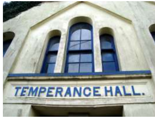
Figure 3.26 - The Temperance Hall, though somewhat neglected is a fine building set in a strategic location at the Victoria Road gateway to the Village

There are a few other public buildings in Roche, but there is less than in some comparable industrial settlements of similar size – no other chapel, no Literary or Mechanics Institute building (although the Temperance Hall provided accommodation for some of these uses), no Masonic Lodge. Most of the public buildings owe more, indeed, to the established, Anglican order than they do to non-conformist ‘industrial’ independence. The rendered, gabled Temperance Hall of 1884 with its lancet windows, for instance, built in memory of Thomas Pearce, rector 1841-63, the Church Sunday School/hall in Fore Street of 1887, stone built with brick detailing, again in a simple village-gothic lancet style, the simple stripped-down detailing of the Board School (now Roche Junior School) of 1871, with its equally stripped down rendered 20th century neo-geo head-master’s house.