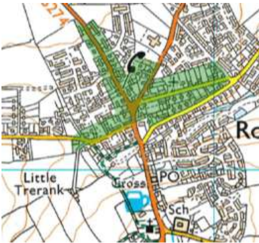
Figure 3.12 - The lower town Character Area

The phrase 'lower town' has little basis in local usage, but is used here as a convenient description of the area centred on the junction of Harmony Road, Fore Street, Victoria Road and Edgcumbe Road, and characterised by the grid-like early 19th century 'location', that was developed here.