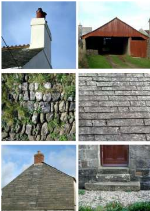
Figure 2.9 - Examples of materials commonly found in traditional buildings in Roche village

A materials palette must be included and illustrated within any Design and Access Statement and should be the subject of a design review. Colour variation should re-inforce local distinctiveness through adherence to the palette of colours already evidenced within the historic buildings. The colour and tone of painted woodwork, especially window frames needs to be carefully considered in conjunction with the walling materials selected. The colour palette must be included and illustrated within any Design and Access Statement and should be the subject of a design review.