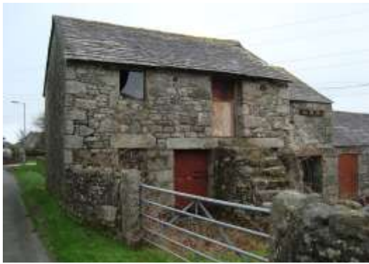
Figure 2.2 - Buildings within Roche Parish historically were constructed from local materials and were of simple design

The quality of design must, therefore, ensure that new buildings contribute positively to the historic character and form of the community. When a traditional design is followed it must be correctly proportioned and detailed and seek when possible to use historically-correct materials. Any development proposal that may affect a listed building or its setting must be discussed with heritage officers at Cornwall Council and with the Parish Council at an early stage of the planning and design process. Layout design should follow historic patterns of development rather than modern 'estate' layouts.