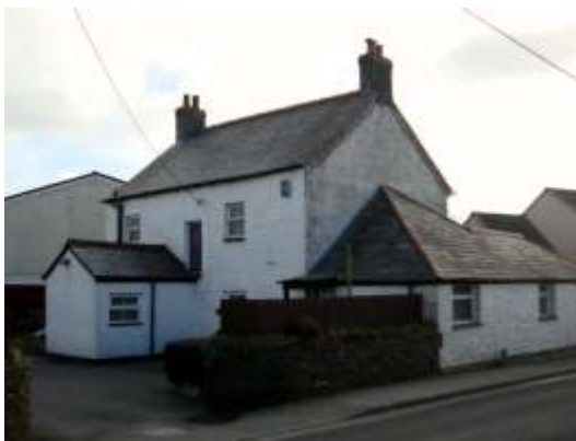
Figure 3.17 - Several old cottages and smallholding survive amidst later development in 'lowertown' which add significantly to the quality of the historic townscape

Despite the somewhat bleak, unenclosed setting of some post-war developments like the Cornish Unit developments along Edgcumbe Road, or the sheltered housing development in Harmony Road (the forlorn setting of the relocated Longstone, symbol of the hopeless destruction of the ancient Hensbarrow country), many historic buildings are scattered amid the later developments – old cottages and smallholdings - many with small walled forecourts or hedgerows with their dominant canopy of mature trees adding to the surviving interest and quality of the townscape.