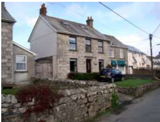
Figure 3.20 - Houses along Tremodrett Road are extremely varied. In places the original hedge boundaries have survived

Although these two roads form part of the smallholding/'location' development of the rest of the lower town, they have been much less unsympathetically altered, and in fact today form some of the most attractive streetscapes not only in Roche, but in any of the clay country settlements. Separated from the main road by slight changes in level (in Tremodrett Road in particular this is perhaps a result of ancient tin-streaming hollowing out the small valley), by turns in the street and pinch-points between buildings, these streets become immediately quieter and gentler than those blighted by the main road.