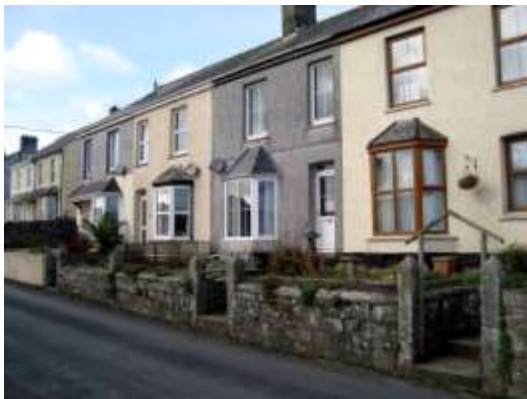
Figure 2.12 - Traditionally even terraced properties have been provided with decent garden space

Roche Parish, including the Village of Roche, is typically low density, with even the terraced cottages usually provided with well sized gardens reflecting the agricultural traditions of the Village.