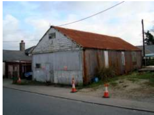
Figure 3.18 - Surviving commercial sheds in Harmony Road

Along Harmony Road, despite much rebuilding, this variety of built form and streetscape is also apparent; there remains here a variety of individual buildings of interest – the single storey buildings on the site of an old smithy on the north side, the commercial sheds on the south side, resplendent in sloping slated roofs or bright red corrugated iron.