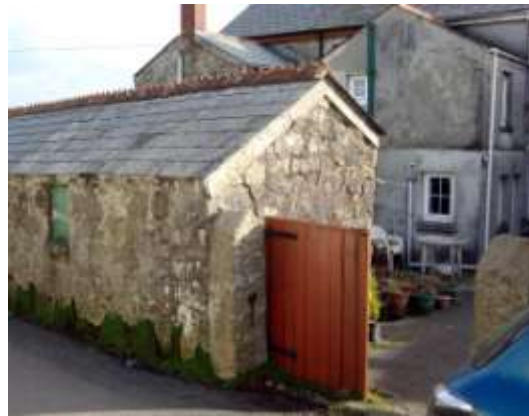
Figure 3.30 - Many of the short terraces in Tremodrett and Chapel Road have interesting architectural details and surviving outbuildings

aces to be found in so many of the clay villages. Although they can now appear rather dour and grey, particularly along the busy main roads, in fact they have some interesting details and good use of materials, seen especially in some of the outbuildings with their large slates on roofs with crested ridge tiles. They maintain traditional proportions and details, shapes and orientation – addressing the streets and following the lines of the enclosure grid. The short terraces in Chapel Road and Tremodrett Road in particular are attractive and pleasantly set in their grounds and in the street, the geometries of the terraces, rear wings, outbuildings and enclosing walls and hedges are a major positive element of the townscape here.