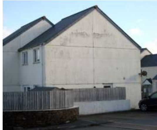
Figure 1.1 - The community is concerned that new development pays little attention to the character and special qualities that make Roche Parish distinctive

In sum, the community expressed growing concern to the Roche Neighbourhood Plan Steering Group that the character and special qualities that make Roche Parish distinctive and attractive are being eroded by standardised new development which pays little or no respect to its location.