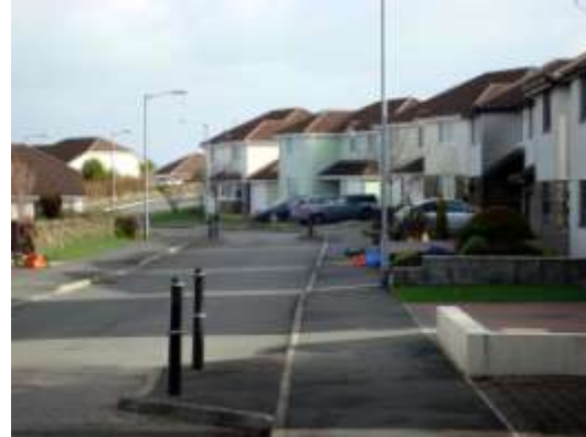
Figure 3.36 - Views into some of the more recent developments from Fore Street bear little reference to the historic character of the Village

toric streetscape, there are views directly into the new developments. The uncharacteristic density of development, the lack of relationship to topography and historic boundary patterns, the complete lack of appropriate landscaping to match the historic setting is all too evident – all seen most damagingly off Fore Street.