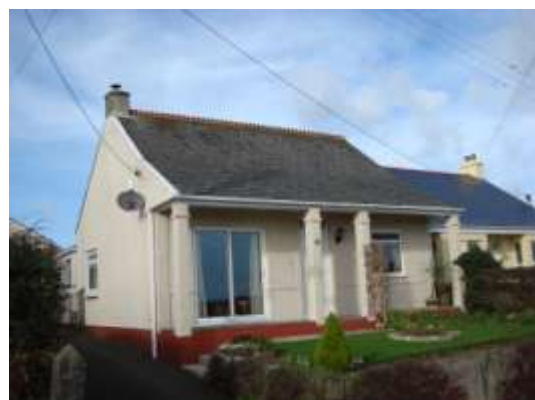
Figure 1.2 - The bungalows at the eastern end of Tremodrett Road are all of single storey design, and have relatively spacious gardens

In order to fit in, new development should respond to the local pattern of streets and spaces, follow the natural topography and take account of traditional settlement form. New buildings should be neighbourly in terms of their scale, height, volume, how much of the site they occupy and the distance from, and effect upon, adjacent buildings and landscape features. The plot coverage of buildings should be appropriate to their scale and provide adequate garden space, while distances from other buildings should maintain adequate standards of privacy and daylight.