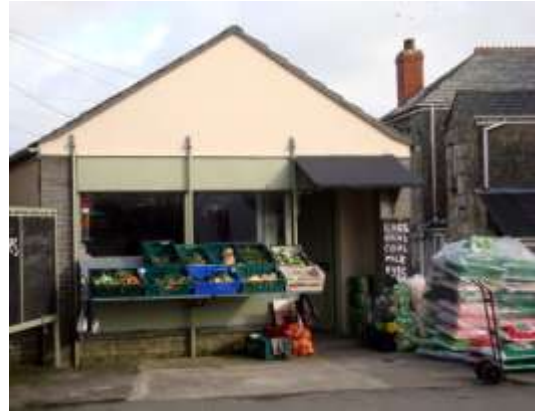
Figure 3.31 - A number of recently built commercial premises retain a 'shed like' character that is entirely in keeping with historic development within the area

The commercial buildings of Roche form an important sub-group within the Village, and have a wider importance. The sort of simple single storey shed used for workshops, retail shops and garages throughout the Village were formerly much more common in rural centres like this. A few survive in nearby Bugle, but Roche has a historically important collection. These range from the large barn-like building in Harmony Road, with its striking red corrugated iron roof (Fig. 3.18), to smaller timber chalets. Although of limited aesthetic or architectural pretension, these buildings have an historical importance as they show how a significant number of village shops appeared – and in Roche there is a continuing tradition of this sort of commercial property, as recently rebuilt premises follow the same simple shed-like pattern, entirely appropriate to the historic character and historic streetscape.