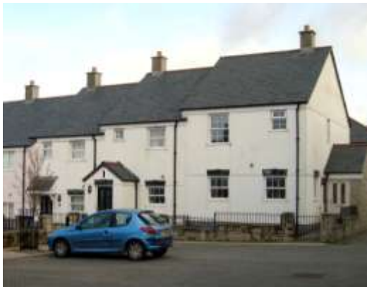
Figure 2.10 - Some modern builds have made commendable efforts to add visual interest with varied rooflines. The use of chimneys stacks reflects features seen in many historic properties

Variation may be achieved by incorporating a variety of building types within a street composition in new development.