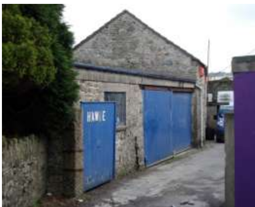
Figure 3.33 - Slaughterhouse buildings behind the butcher's

There are good outbuildings associated with other farms and smallholdings, whether traditional stone-built buildings or later, corrugated iron clad barns and sheds, as well good ranges to the rear of commercial buildings – like those to the rear of Edgcumbe Road, the slaughterhouse range to the rear of the butchers - or to the rear of larger houses.