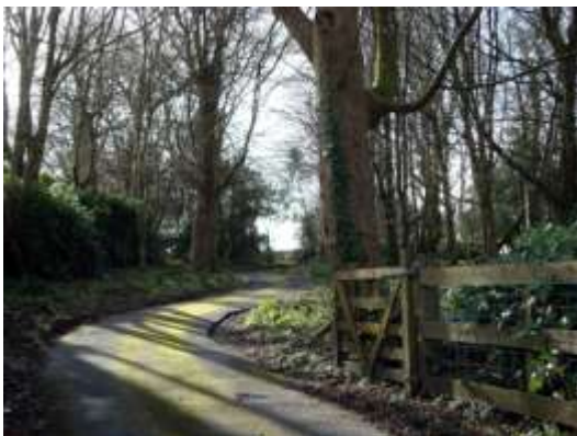
Figure 3.40 - Mature trees remain a dominant feature in many parts of the Village

But perhaps most characteristic of Roche are the glimpses, the side views into the back yards and outbuildings of the centre, into secret gardens, the unfolding views along short lengths of road like Tremodrett Road, the glorious informal walk along the Avenue into the twisting lanes of the Churchtown. Everywhere these views and glimpses are framed and overshadowed by the dominant canopy of trees.