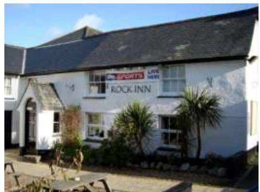
Figure 3.3 - The Rock Inn is reputed to date from the sixteenth century

The Churchtown was historically more obviously a nucleated settlement, with buildings on the west side of Fore Street (close to the site of the New Rectory), Tregarrick Farmhouse and its adjacent cottage (all now demolished) and the Rock Inn.