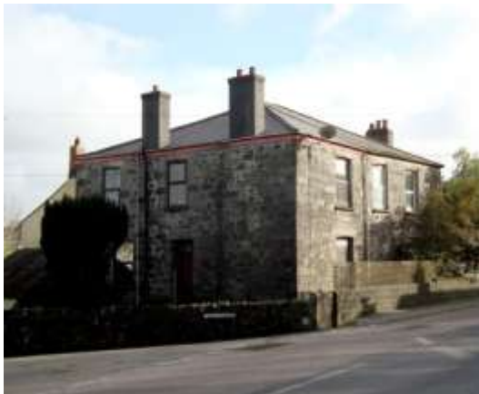
Figure 3.29 - Designed to look like a single large house, 13-15 Fore Street is actually two properties

The 'polite' architectural element in Roche thus forms a significant element of the character of the Village; it ranges from high status houses, to the main-street commercial and residential buildings; it even influenced changes in later years to some of the surrounding buildings – nos. 13/15 Fore Street, although a semi-detached pair, were designed to look like a single, elegantly grand house.