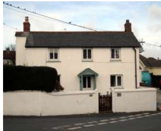
Figure 2.6 - High quality building design abounds in Roche and surrounding parish. Development was informed by the economic, social and spiritual needs of the community

Roche Parish has a rich legacy of high-quality development within its historic fabric. Patterns of development were historically informed by the evolution of agricultural, industrial, social and religious needs and the landscape.