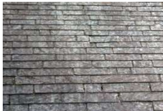
Figure 2.11 - Silver grey natural slate in diminishing courses is typical of roofs in the Parish and contribute greatly to its character

Silver grey natural slate in diminishing courses is typical of roofs in the Parish and contribute greatly to its character. Thus there is a preference for natural slate to be incorporated within new development. Alternatives which might be considered include artificial slate only if this has a similar colour, texture, variety of unit sizes and diminishing coursing per local slate roofs. Avoid dark coloured slates as the effect can be very austere, and avoid cement fibre slates that create a dark, brittle and shiny effect and bland appearance. Ridge tiles are typically red or grey.