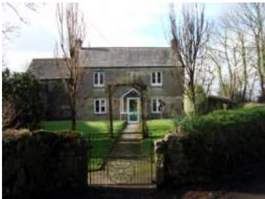
Figure 2.7 - Many properties in Roche have good sized gardens often with walled front gardens. This tradition has its origins in the old farmhouses and smallholdings that can still be found around the Village

No stylistic preference is given in the design of new buildings but the range of buildings and materials incorporated in cottages through to larger, more formal houses is substantial and provides inspiration to achieve a quality within new design and development that is commensurate with the best of the community.