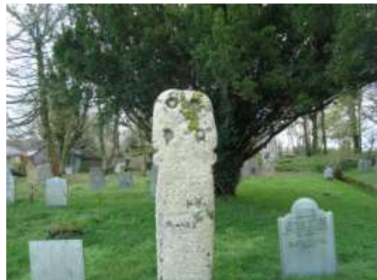
Figure 3.24 - There are many old and important headstones and monuments in St. Gomonda's churchyard

The Church, although with Norman antecedents, is basically 15th century in date; after its virtual destruction in 1822, the interior was extensively and sensitively reconstructed in 1890 by J.D. Sedding, one of the most significant 19th century architects working extensively in Cornwall. The lovely churchyard contains a wealth of old headstones and chest-tombs (several listed), walls and structures (including an important early Christian cross, a scheduled monument).