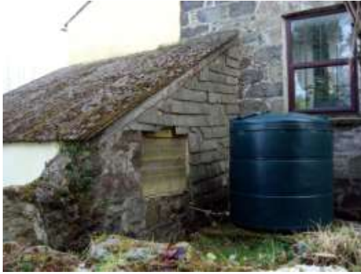
Figure 3.34 - Slate hung outbuildings to the side of 13-17 Fore Street. Dark, basaltic-looking Schorl stone can be seen in the main building

The slate hanging in Roche tends to be of large scantling slates, also used for roofing, although most roofs are of smaller sized slates; no. 1 Tremodrett Road has a fine patterned slate roof with bands of fish-scale tiles. The traditional slate roofs survive reasonably well in Roche although there has been significant replacement in recent years. Because of the local topography, the way the Village sits within the slopes of gentle but pronounced valley, the roofscape is extremely important in Roche, it is not just the prominent buildings that stand out, nearly all buildings can be seen from above from somewhere, and nearly all can be seen from the back as well as the front. Even in the central junction area, the fine slate roofs and crested ridge tiles of the Co-op, the Temperance Hall and no. 13-17 Edgumbe Road are an important feature.