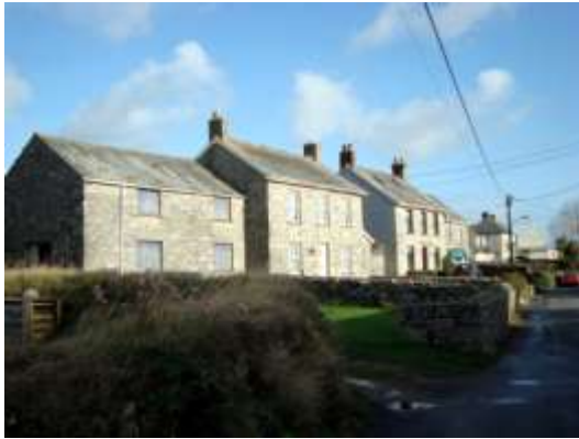
Figure 1.3 - New development should use locally distinctive building materials and be designed to 'fit in' and complement the traditional character and identity of its older neighbours

New buildings should express locally distinctive building traditions, materials, character and identity. That is not to say that all buildings should be the same or traditional in character but, by reference to these local details, new buildings should fit in and make a positive contribution to their surroundings.