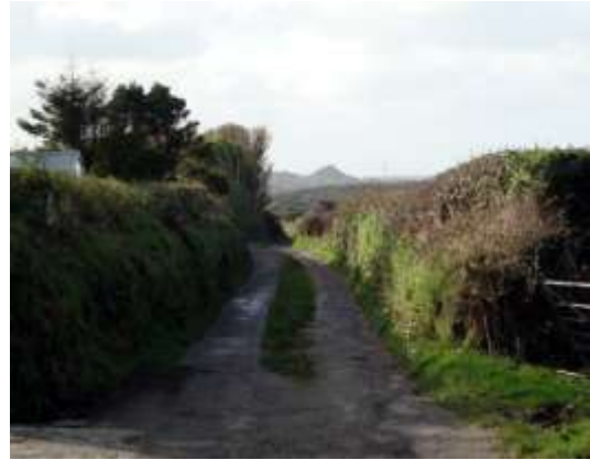
Figure 3.38 - China clay dumps visible from the lanes at Churchtown

Beyond the spreading housing estates are still wide swathes of open countryside; the landscape here is relatively flat, the valleys are gently sloping, so that there are long views over fields and trees to the distant monuments of the china clay industry, particularly the white peaks of the ever-growing dumps to the east and south. These close off all views except to the north where the Castle-an-Dinas/Belowda Beacon hills stand lowering over Goss moor – a reminder that Roche anciently stood at the meeting point of various landscapes and routes, and should not be thought of simply, or even primarily, as a china clay settlement. The roads on the outer edges of the Village all have long, straight vistas along them terminating in white crests of clay dumps; a direct visual link given greater impact by the re-routing and straightening of older routes in the mid 19th century (certainly that to Carbis past The Rock) .