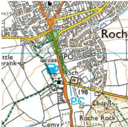
Figure 3.9 - Fore Street Character Area

The first stage of growth away from the Churchtown was along Fore Street. Much of the current character of Fore Street, all the way down to its junction with Harmony Road/Victoria Road, dates from the major changes of the first decades of 19th century. At this date the Church was heavily altered (1822), new Rectory was built (1822) and the old east-west road re-routed into the newly created Harmony Road. It is clear that much of Fore Street was re-built at the same.