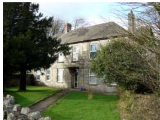
Figure 3.19 - 22 Harmony Road

Further out, along Harmony Road, the bleak, suburban turning into the Marshall Close estate and the bare tarmac settings of late 20th century bungalows and housing gives way to a varied group of largish houses; when built they stood slightly outside the main village, all have pretensions to greater status than the workaday core, with the elegant dressed stone classical elevation of number 22 Harmony Road dominant.